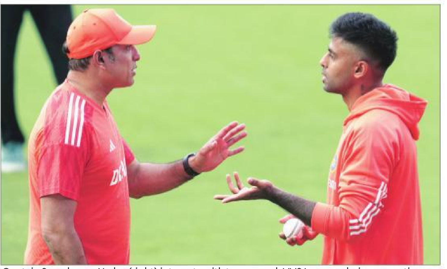
Captain Suryakumar Yadav (right) interacts with team coach VVS Laxman during a practice session on the eve of the first T20 match between India and Australia, in Visakhapatnam

Surya didn't set the world on fire in the World Cup but has