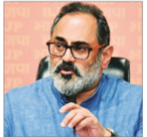
Rajeev Chandrasekhar, minister of state, IT

On Tuesday, minister of state for electronics and IT Rajeev Chandrasekhar said India has entered into eight memorandums of understanding (MoUs) with countries such as Armenia, Sierra Leone, Suriname,