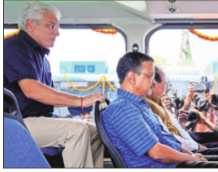
'1500 ई-बसों के लिए डिपो तैयार'